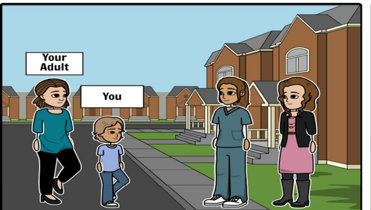
You are visiting our centre because someone has told us that they are worried about you.