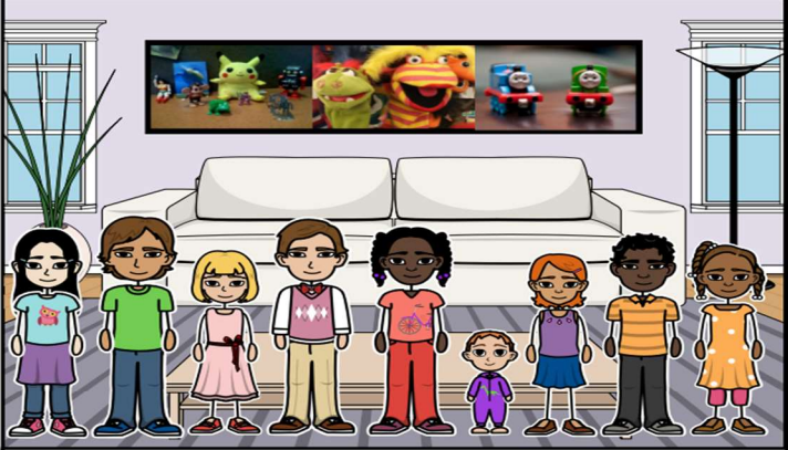
Lots of children visit our centre, and our job is to check that they are all OK.