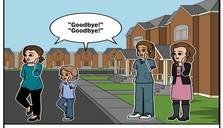
After the adults have talked to each other, we can say "Goodbye!"