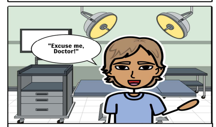
The check-up won't hurt at all. But, if you are not comfortable during the check-up, just let your Doctor know.