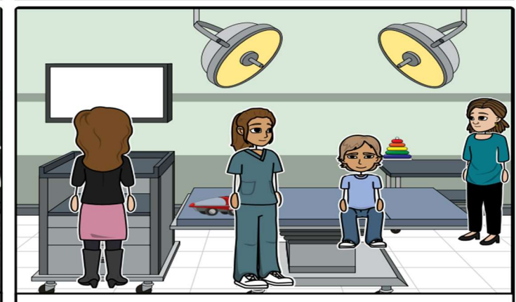
In this room, the Doctor will do a check-up on your body. They might use a special camera, and take some notes too.