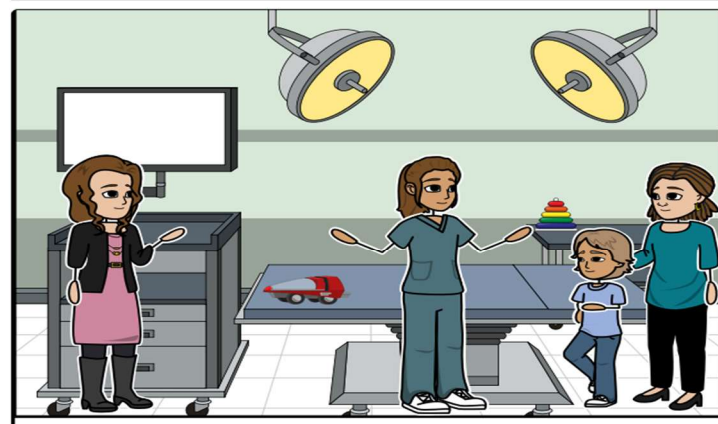
Once you have played with the toys, the Doctor will show you to their \operatorname{Doctor} 's \operatorname{room} .